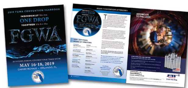
2019 FGWA Convention Yearbook

If you are interested in showing your support of the FGWA and advertising your company and its products at the same time, please return your exhibitor agreement today. Advertisers will be contacted by FGWA regarding specifications and deadlines once the agreement has been received. Please note that the FGWA Convention Yearbook will be printed in full color, all ads submitted must be in full color. No black & white ads will be accepted.